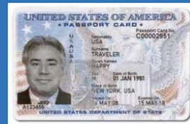
Example Photo of Passport

NOTES: "Route" is asking for the city of the LAST airport you pass through before entering Bolivia. "Place of application" is asking for the consulate from which you are obtaining the VISA.